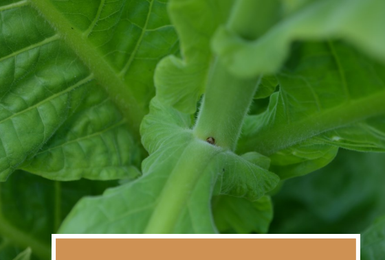
Better Contact with Suckers